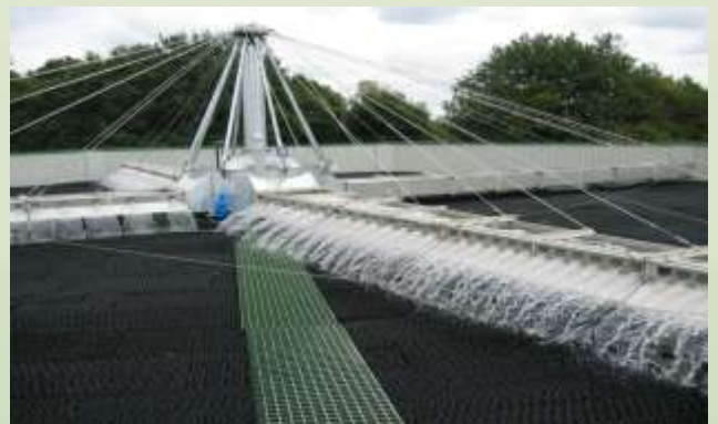
4 Arm motor driven HYCOVER trough arm distributor applying some 360 lt/sec to 20.0 mt dia HYRATE nitrifying filter.