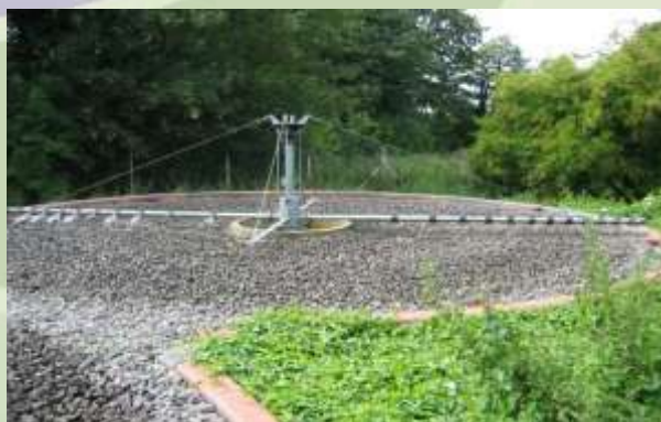
2 Arm reaction driven HYCOVER 'Lo-Flo' tubular arm distributor applying 3.2 lt/sec to an 18.0 mt dia stone trickling filter.