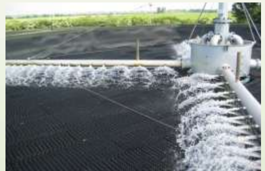
4 Arm motor driven HYCOVER tubular arm distributor applying some 170 lt/sec to 12.0 mt dia HYRATE nitrifying filter.