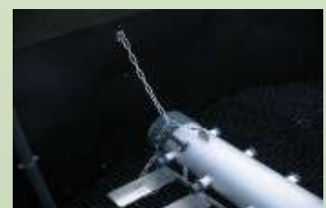
Distributor arms are fitted with Quick strip full flow washout end cap & stainless steel chain..