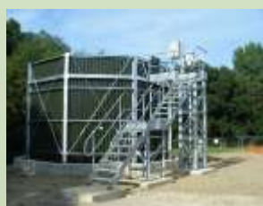
Typical HYRATE Polytower with stairway and local control panel on top platform adjacent to doorway