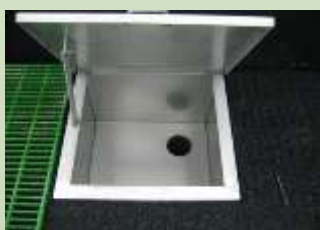
Stainless steel washout box set into surface of media adjacent to access doorway.

Twin tubular arm HYCOVER rotary distributor with variable speed drive arranged to apply up to 60lt/sec of secondary sewage effluent to the surface of a 22.5mt Ø HYRATE Polytower packed to 6.0mts with some 2430m 3 of modular plastic media